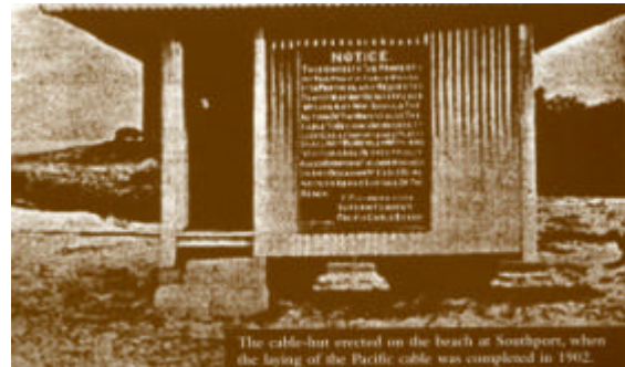
The Cable hut

Some of the photos of Southport Cable Station copied from the commemorative booklet