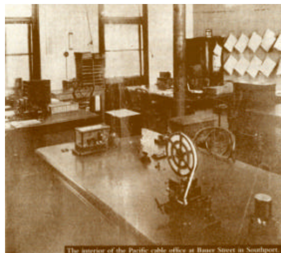
Interior of the Cable Station