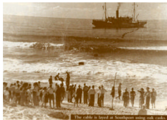
Landing the cable at Southport Beach