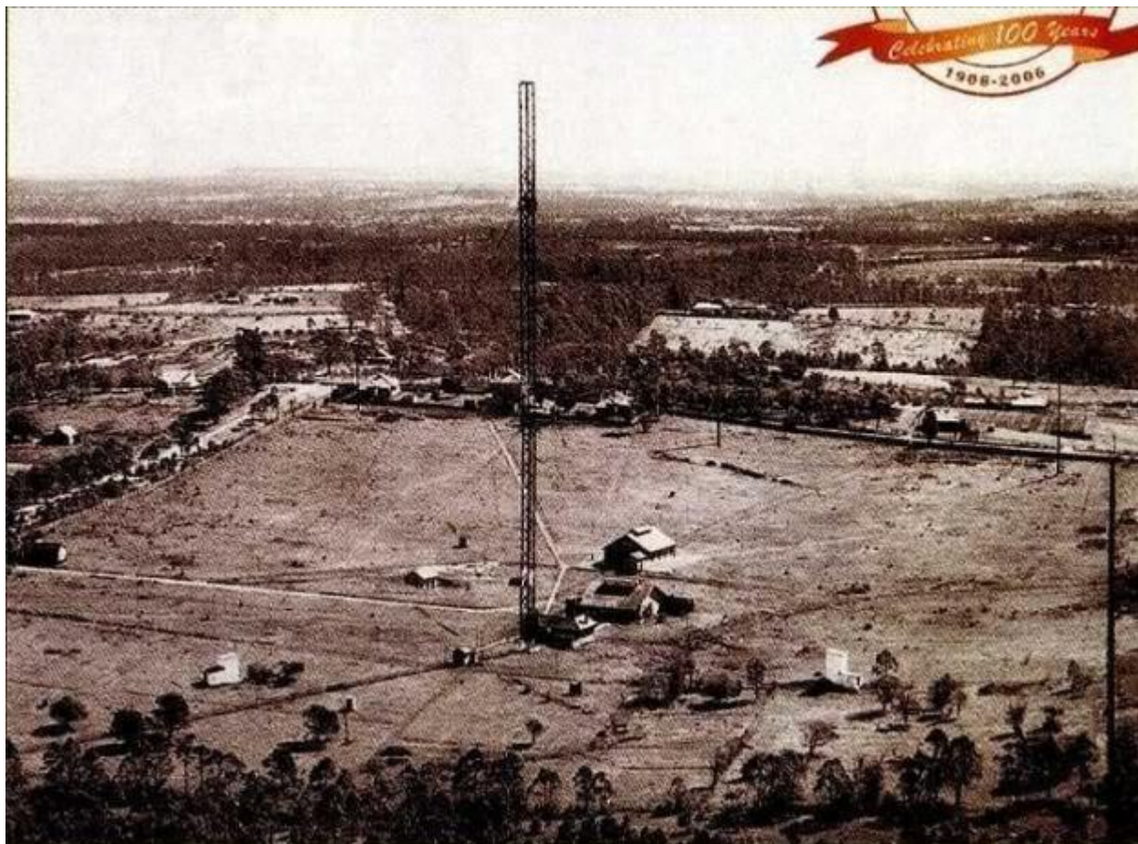
The above was officially called the Pennant Hills Wireless Station but as far as locals were concerned it was a Carlingford landmark.