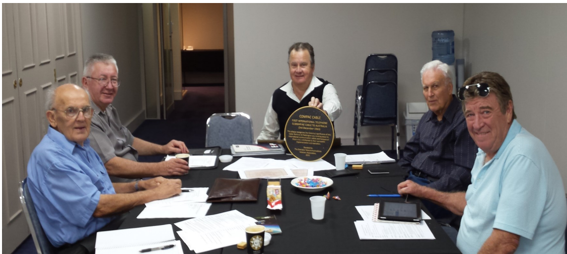
The plaque unveiled at the recent committee meeting.

in Australian telecommunications history as Australia moved from HF Radio to Cable transmission links that connected Australia to the rest of the world and enabled Australian commerce to overcome Australia's remoteness from global commercial centres and its overseas trading partners. From this single event OTC embraced cable & satellite communications to better enable Australians to communicate with business associates as well as friends and relatives overseas and the vision of "No one's Far From Anyone, Anymore" emerged.