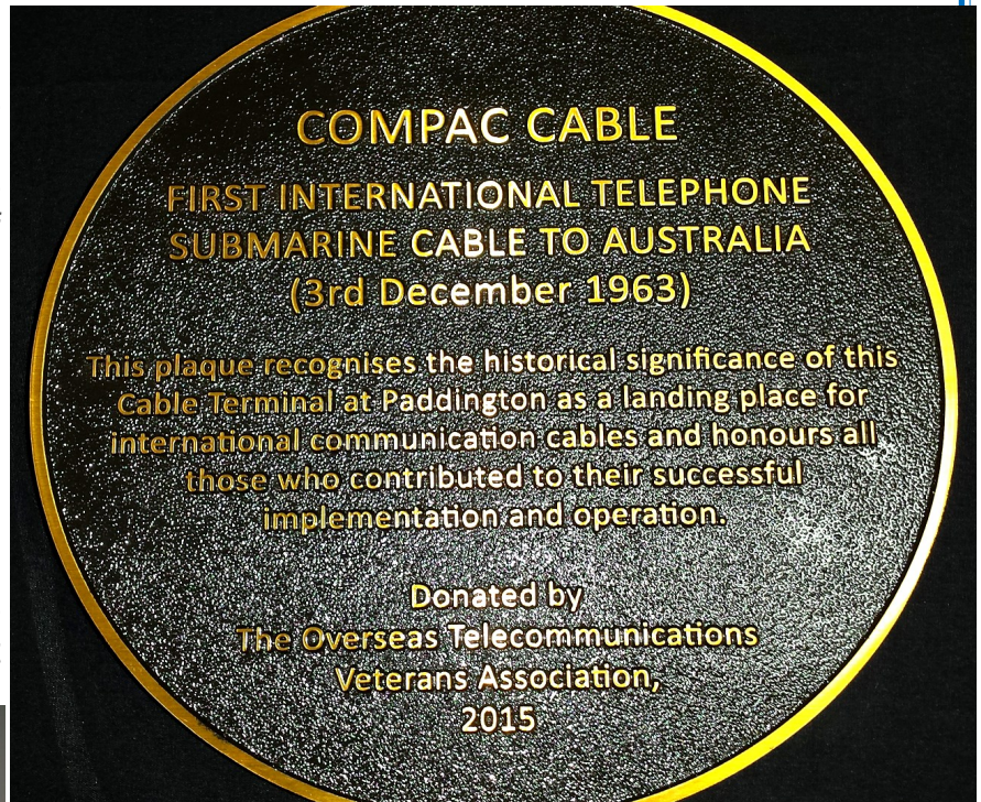
The soon to be mounted plaque manufactured by Charlie

The plaque commemorates the landing of the Compac Cable in 1962, the opening of Compac on 3 rd December 1963 by HM Queen Elizabeth II and the role of OTC staff in facilitating that successful venture. The opening of the Compac Cable was a significant event