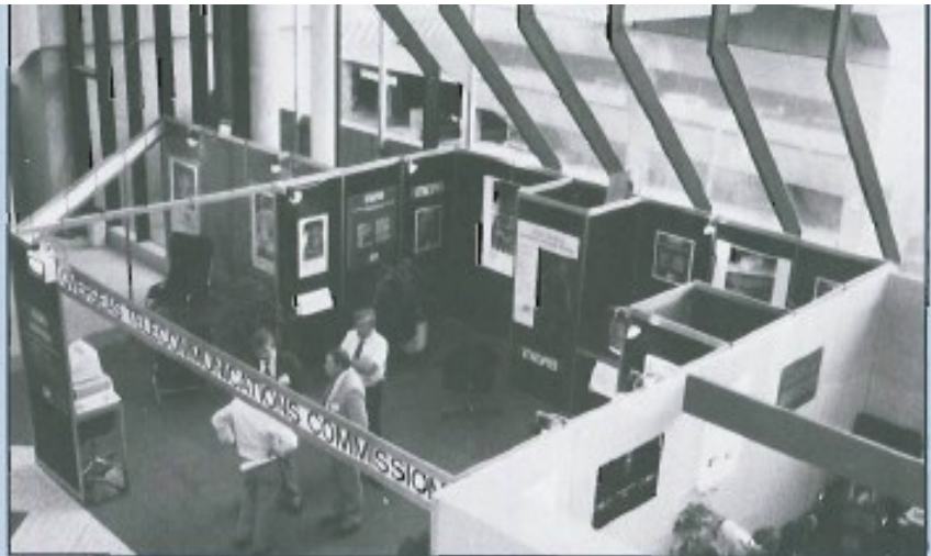
This 'bird's eye view' of OTC's display stand, courtesy of Eddie Hope, gives some idea of the detail involved.

Also in the pipeline, to help the public better relate to such 'high-tech' services, is a video tape showing how simple they are to operate. It's to be hoped that incorporation of the video in the product display stand will help generate more enquiries about the services.